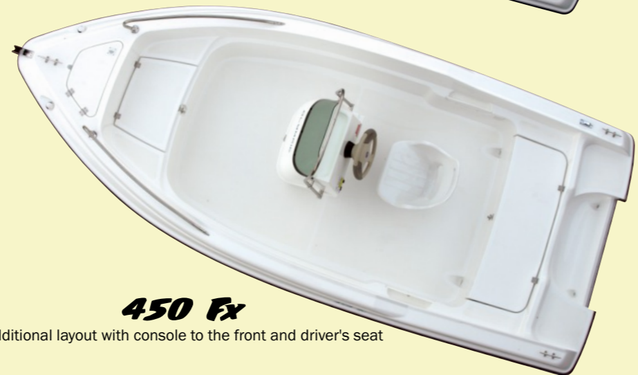
450 Fx Additional layout with console to the front and driver's seat