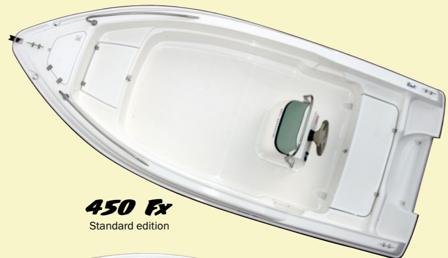
450 Fx Standard edition