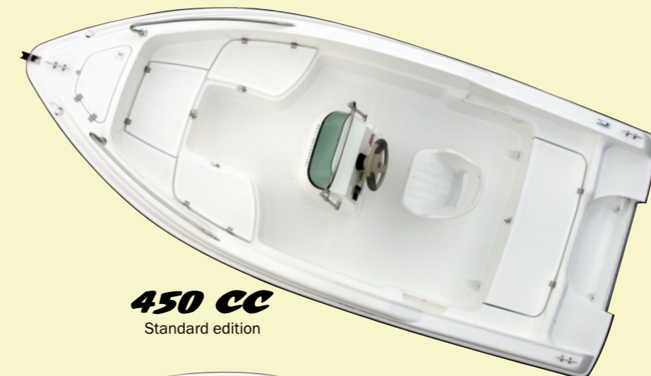
450 CC Standard edition