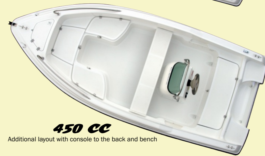
450 CC Additional layout with console to the back and bench

A large storage space is available under the stern seat. Also, the anchor light is stored under the seat when not in use. The side shelves for small personal accessories is an additional detail that makes the Olympic 450 to stand out from the competition. ▼▶